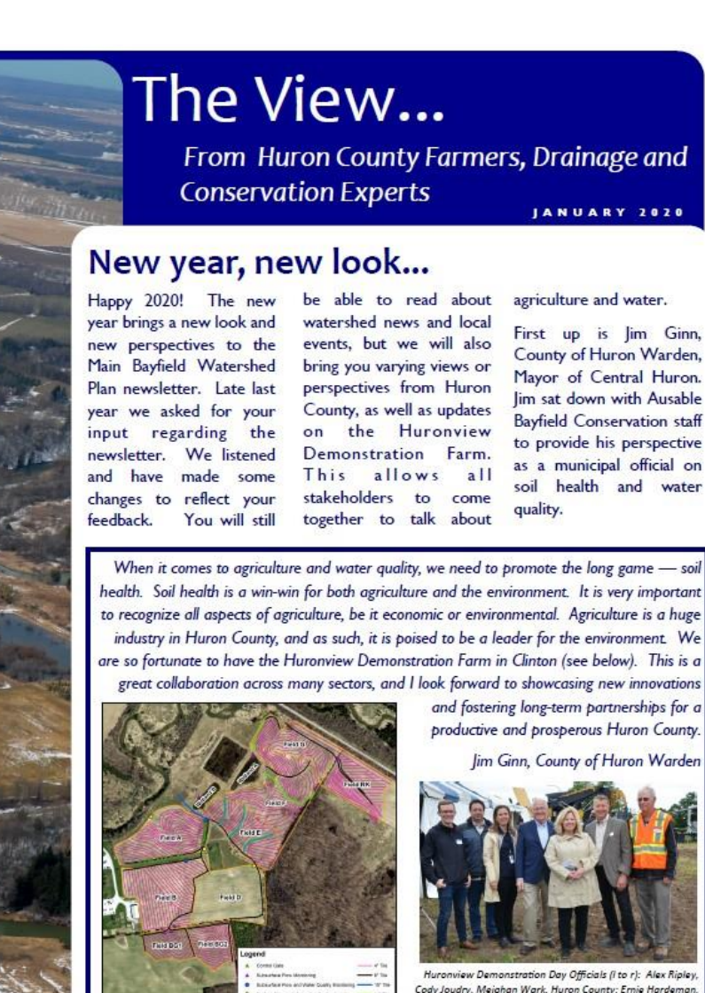
Figure 2 – an example of The View, a newsletter featuring different agricultural perspectives.