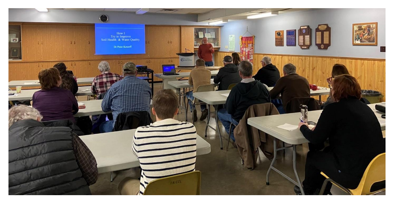
Figure 1- Participants at the Nutrient Management Workshop, co-hosted by the St. Clair Region Conservation Authority and the Lambton Cattlemen's Association, Alvinston ON, January 22, 2020.

Participants filled in a survey to gauge their understanding and provide an opportunity for feedback about the kind of information shared. Eight participants returned surveys to the workshop organizers. Of the eight surveyed, six stated that their understanding of the Sydenham watershed processes (and by default, the state of the lake), as well as critical habitats was only poor to fair. When asked what kind of BMPs (in their opinion) could be beneficial to watershed health and species at risk, BMPs such as erosion control measures, cover crops, and reduced tillage were all submitted. Some of the topics/BMPs that they were interested in learning more about included cover crops, biostrips and planting green, reducing compaction, agricultural soil biology, reduced tillage, organic amendments, rotational grazing, soil sampling and 4R Nutrient Stewardship.