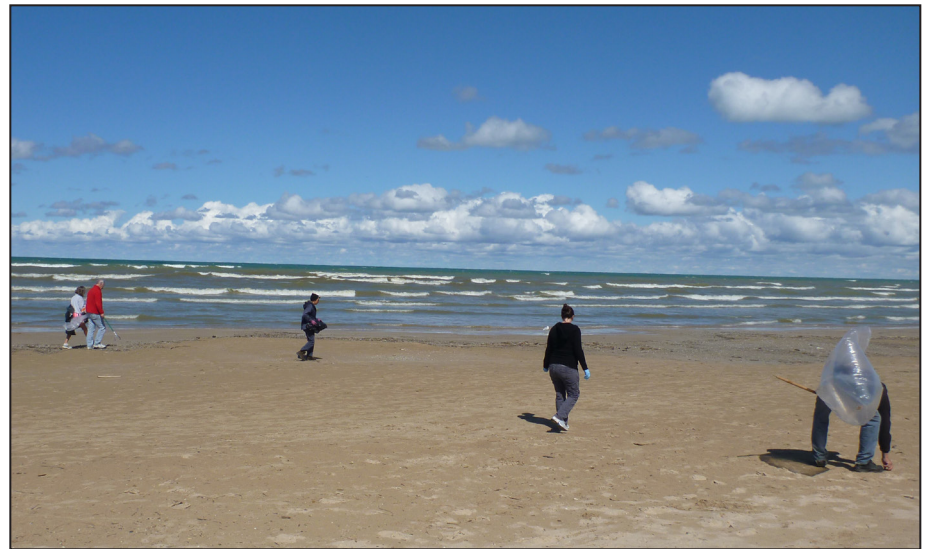
A group of local shoreline residents participated in a Great Canadian Shoreline Cleanup event at Centre Ipperwash Beach.