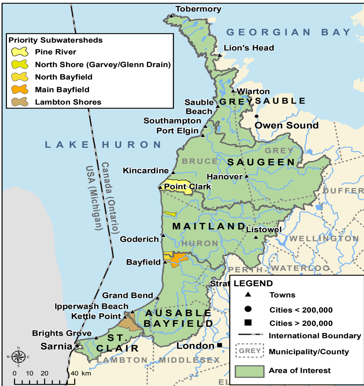
Map of the Healthy Lake Huron area of interest boundaries.