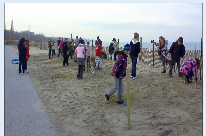
Grade 6, 7 students from Huron Heights Elementary plant locally harvested American Beachgrass at Station Beach.