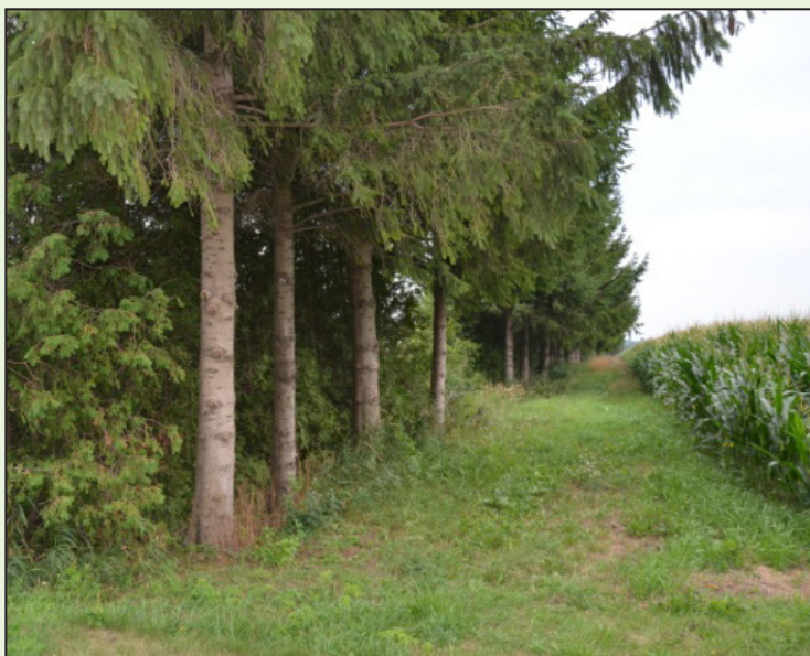
Eastern white cedar and Norway spruce planted as a windbreak on an Ontario farm.

To watch the videos, visit ontario.ca/farmstewardship and click on windbreaks.